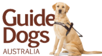
Guide Dogs Australia