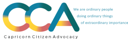
Capricorn Citizen Advocacy