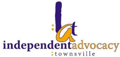
Independent Advocacy Townsville